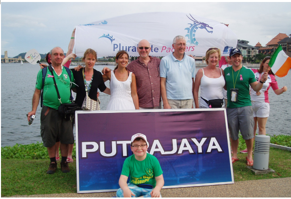
Malaysia 2011 Supporters