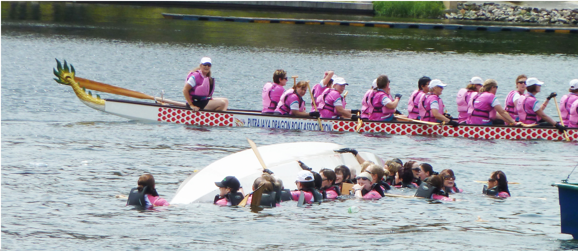
The famous capsizes in Malaysia that has gone down in Plurabelle lore!